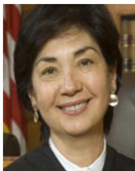
Hon. Fernande R.V. Duffy, Boston Appellate Court Judge