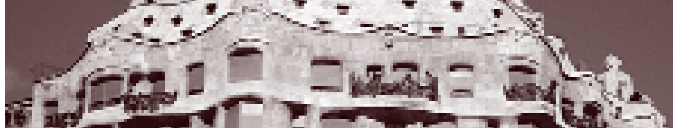
Casa Milà "La Pedrera".