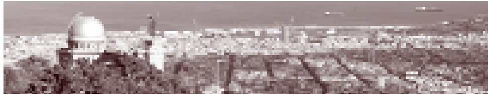
Panoràmica des de Tibidabo.