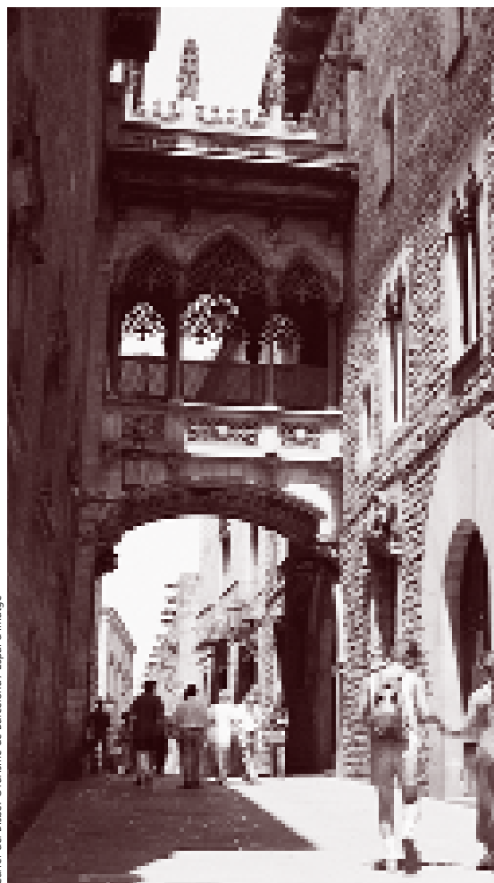
Carrer del Bisbe.

The workshop will present various ideas on the “didactics” of judicial ethics, with particular reference to the content of “implicit” values rather than “explicit” values in the teaching of new judges and it will deal with the advantages and disadvantages of each teaching method.