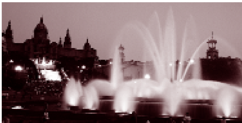
Font Màgica de Montjuïc.