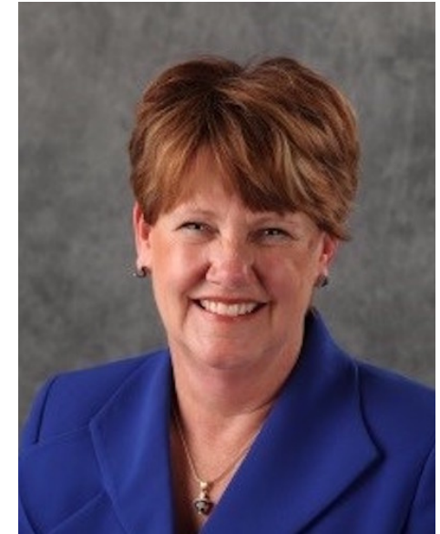
Judge Sue Dobrich Michigan