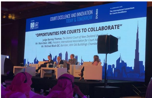
Photo: Panel members on stage speaking about opportunities for courts to collaborate.

Other presentations on the first day of the conference introduced delegates to virtual hearings at the Small Claims Tribunal at the DIFC, the UAE/Gulf Cooperation Council Judicial System, the Commercial Court of Dubai, the Abu Dhabi Global Market courts and the use of bench experts in Bahrain. In the session on the evolution of international courts towards court excellence, the audience heard about using principles of procedural justice, and the benefits of the ICCE as a national health check of courts from speakers Judge Victoria Pratt from the Newark Community Court in the United States, Judge Barney Thomas, from the District Court of New Zealand and Lord David Hope, Chief Justice of the Abu Dhabi Global Market Courts.