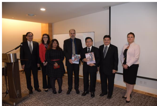
Photo: ICCE representatives with the Chief Justice of Malaysia and staff of the Office of the Chief Justice.

Since the workshop in October, the Office of the Chief Justice continues its forward progress, now working to establish a charter for a Judicial Strategic Planning committee to oversee the efforts and integrate the strategic plans throughout court levels.