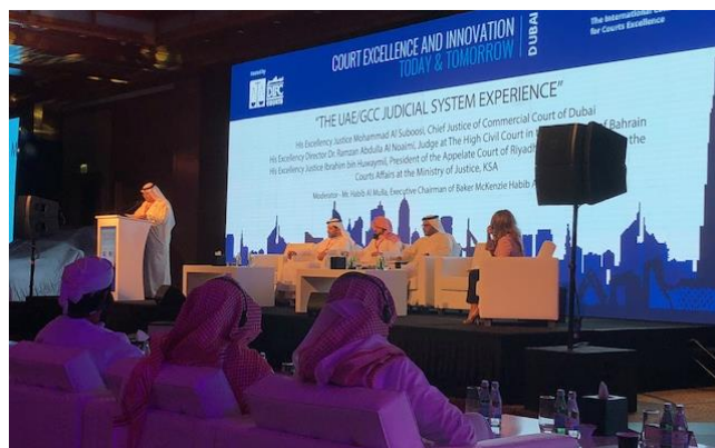
Photo: Panel members discussing the UAE/GDD Judicial System Experience