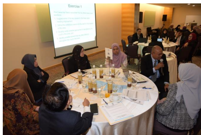
Photo: IFCE workshop participants

Eagerness to identify points for comprehensive justice sector reform was demonstrated by enthusiastic participation from court judges, participants and the UNDP. The workshop benefited from approximately 60 court leaders throughout the courts of Malaysia.