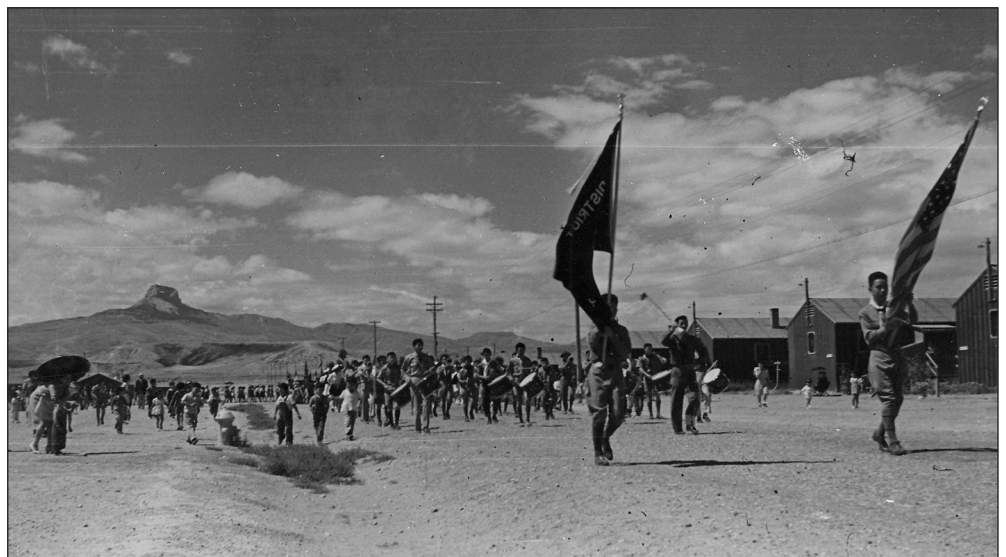
YONE KUBO COLLECTION

Within the troops, the earning of merit badges was one of their busiest activities.