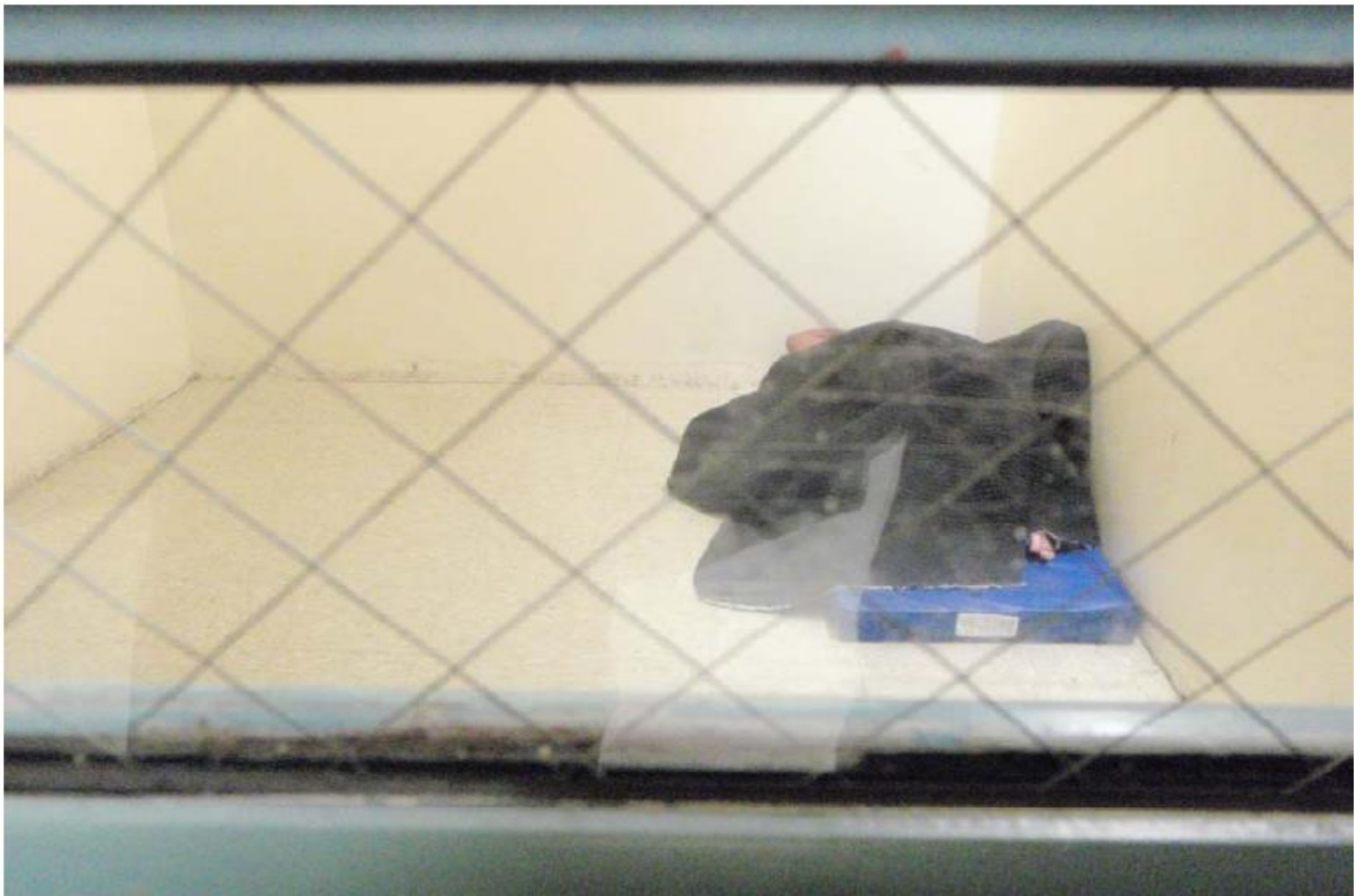
CCI-28 July 29, 2008 Outpatient Housing Unit (OHU) cell