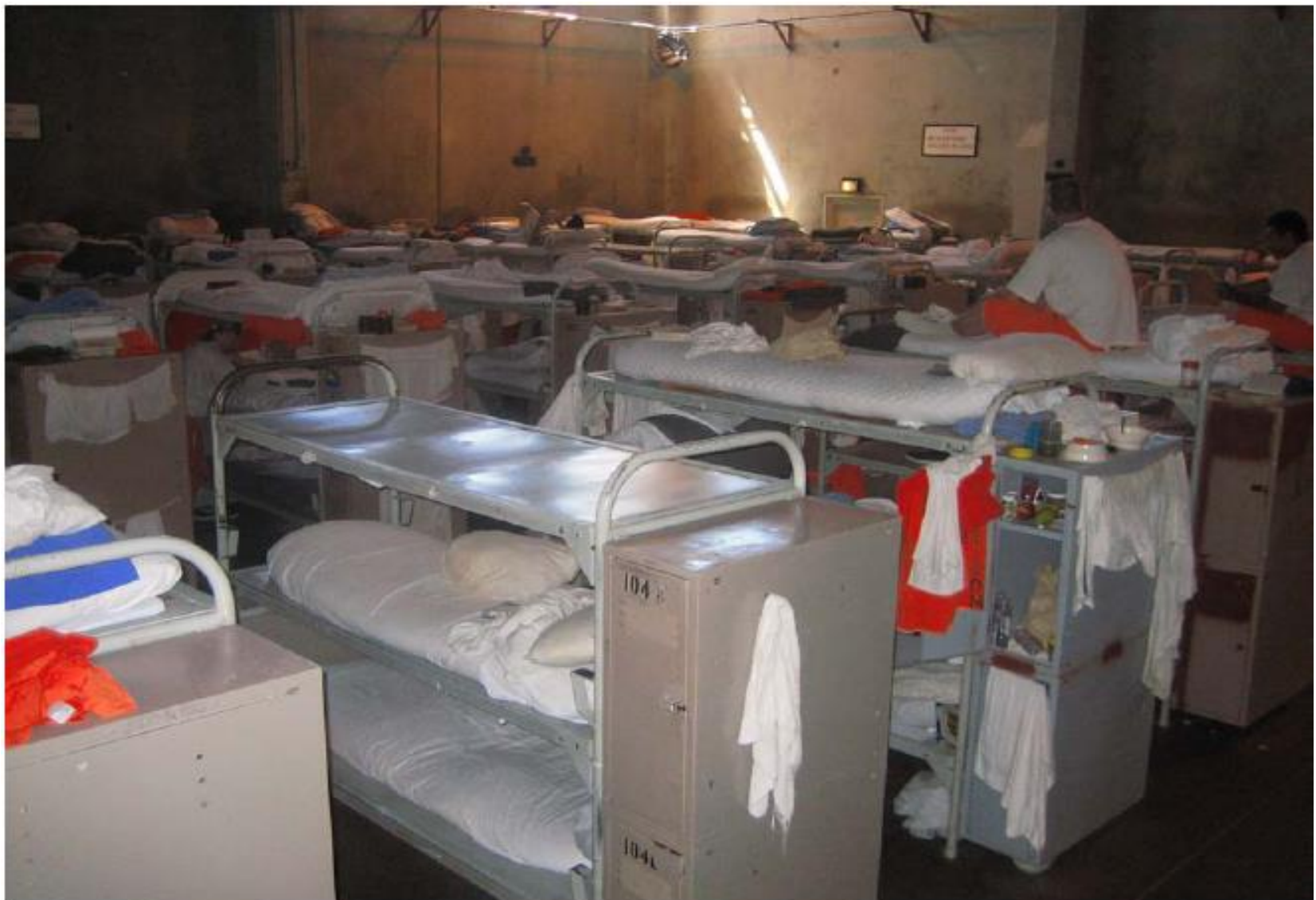
WSP-26 August 1, 2008 Facility A Gym