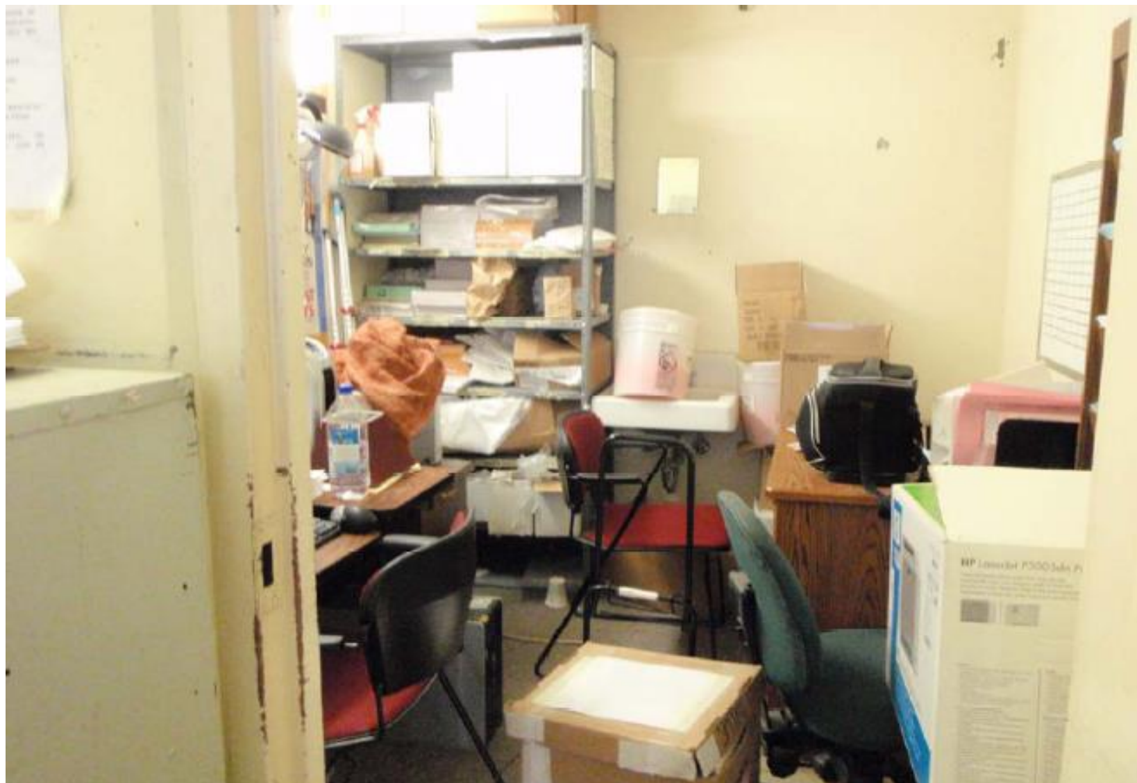
CCI-31 July 29, 2008 Facility 4A-8 Office