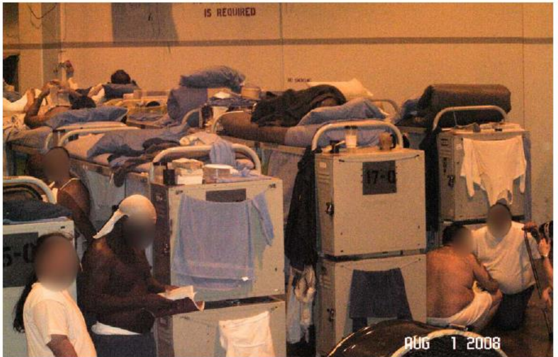
MCSP-7B August 1, 2008 A-yard Gym Dorm