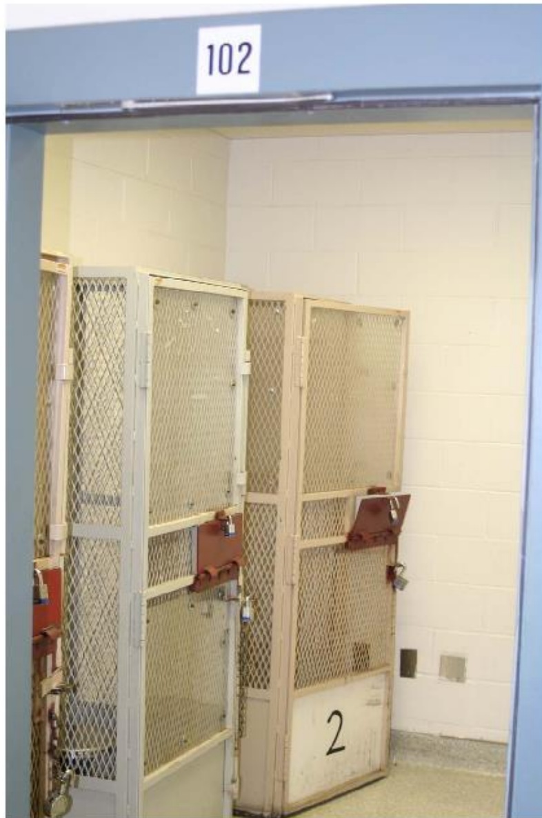
SVSP-13 July 29, 2008 CTC (dry cages / holding cells for people waiting for MHCB)