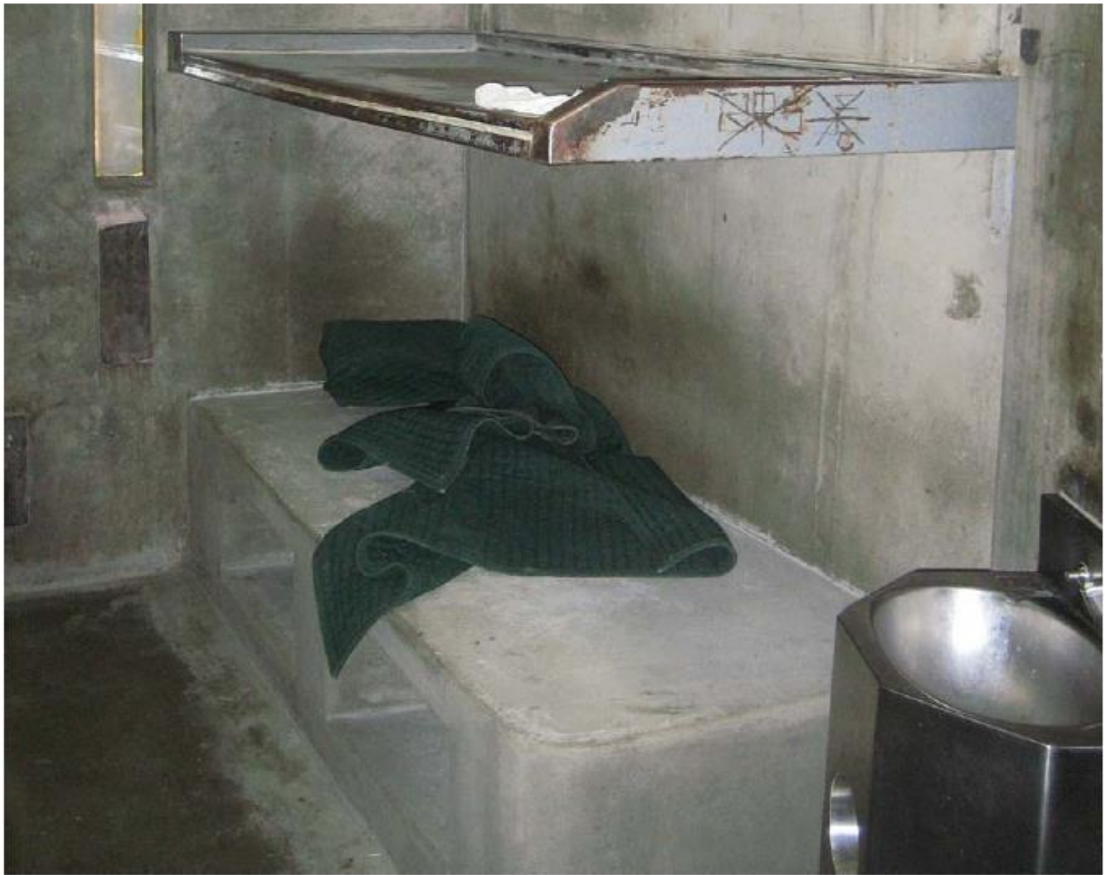
WSP-17 August 1, 2008 Facility D, Building 6A, suicide watch cell