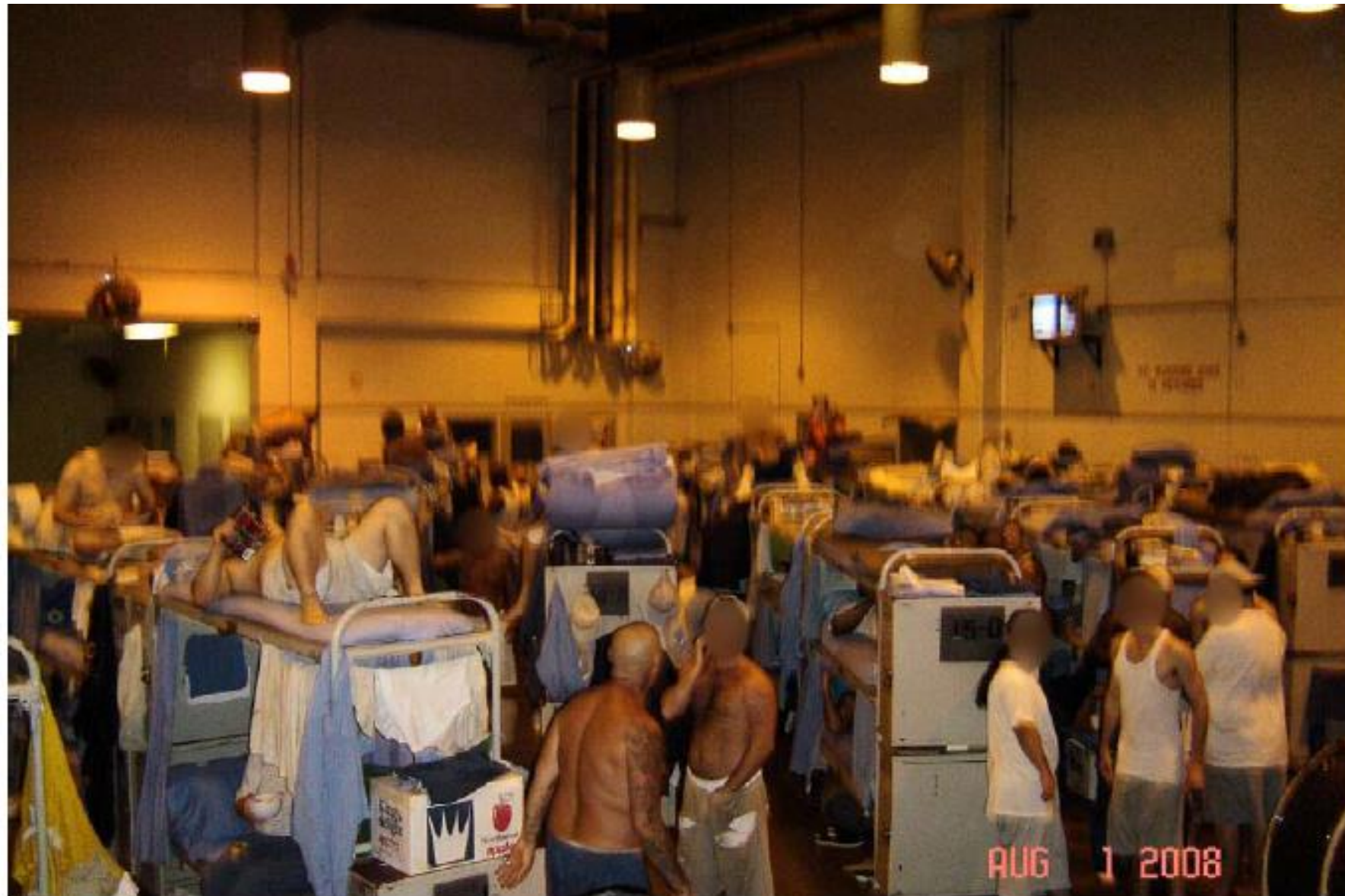
MCSP-6B August 1, 2008 A-yard Gym Dorm