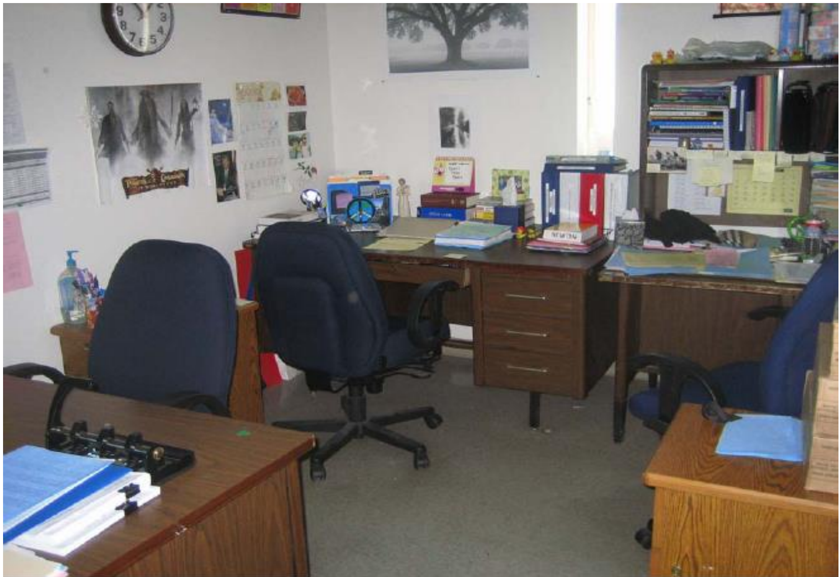
WSP-3 August 1, 2008 Mental Health Office