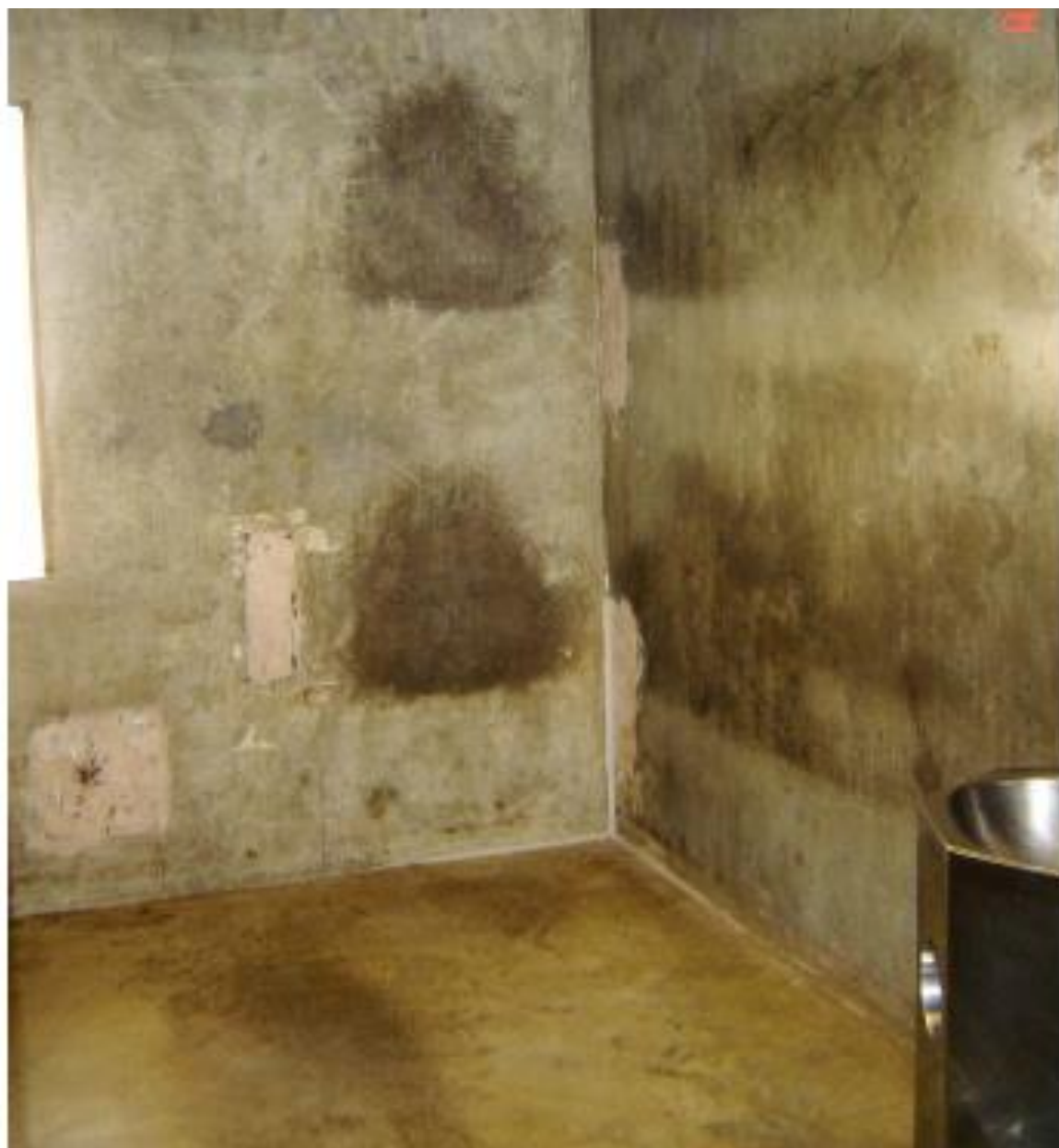
MCSP-12 (CELL USED FOR ACUTELY SUICIDAL PATIENTS) August 1, 2008 MHOHU Cell in C-13 building (C-Yard, Building 13)