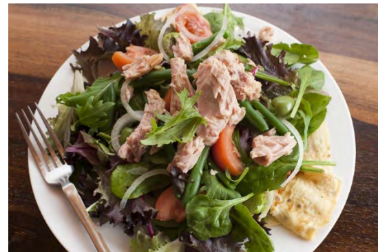
Salad nicoise topped with tuna