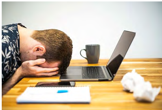
Burnout At Work - Occupational Burnout.jpg by Microbiz Mag is licensed under Creative Commons Attribution 2.0

Burnout is characterized by 3 dimensions: exhaustion, cynicism / depersonalization, and inefficiency.