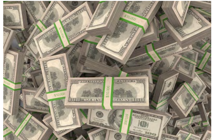
Falling bundles of money by Unknown Author is licensed under CC BY-ND