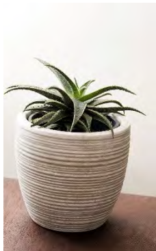
Potted ornamental aloe in a ridge white flowerpot by gratuit is licensed under CC BY