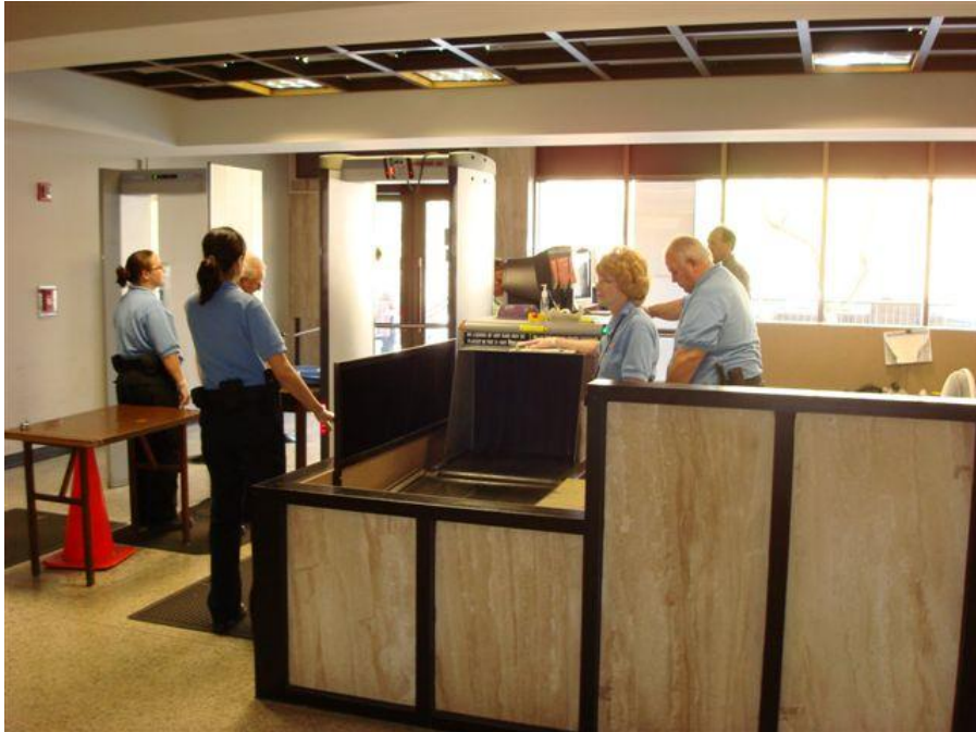
Entry Screening – A Court’s First Line of Defense