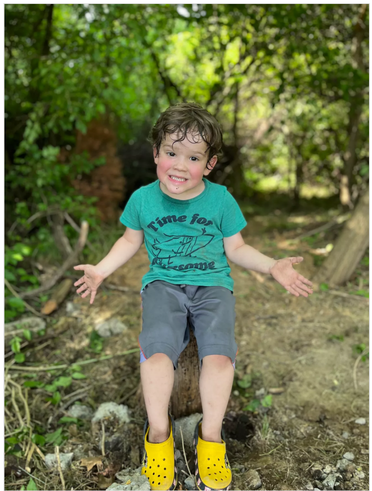
LOL - this!!! - ANONYMOUS

The need for Indigenous law to impact and influence child welfare. (ICWA = gold standard of child welfare)