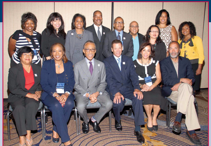
(Commission Members Left to Right)