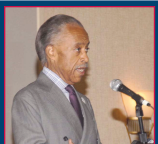
Reverend Al Sharpton addressing audience

On Wednesday night, after the opening reception, Niagara Falls was lit up in the color blue in honor of the Commission and the Consortium Conference. We are grateful for the support of the upstate community which contributed to the success of the Conference.