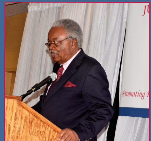
Hon. Samuel L. Green