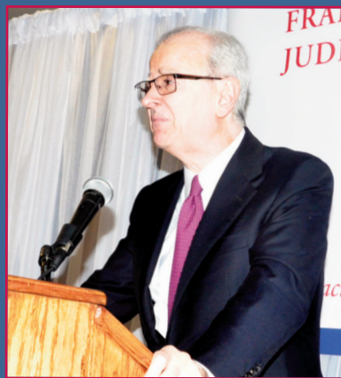
Hon. Jonathan Lippman