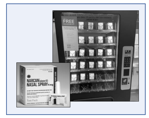
Exhibit 1: Naloxone vending machine and box containing two nasal spray kits

In 2021, Dr. Ray worked with Shaffer Distributing to customize vending machines to distribute free naloxone. This customization included removing the payment mechanism and altering the machine coils to distribute the standard two-kit intranasal naloxone kits (see Exhibit 1).