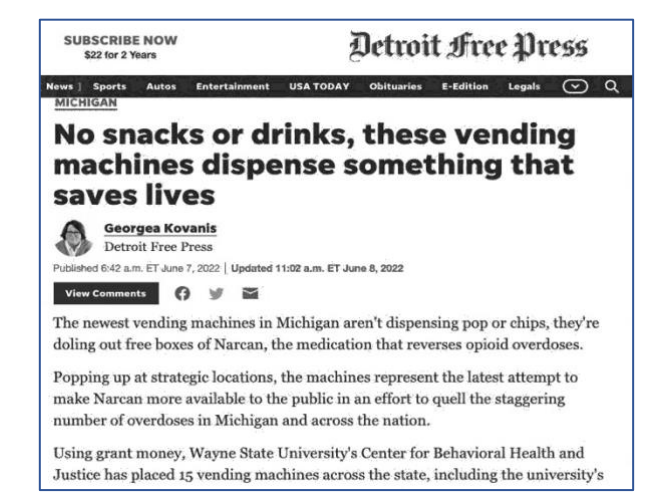
Exhibit 3: Implementation Facilitator Example from Early Adopter

Jails that had implemented opioid use disorder medications had a much better understanding of naloxone safety and the need for this medication in addressing overdose.